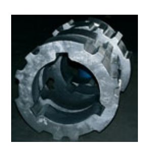
Claudius Peters Clinker Cooler Crushing Ring