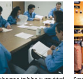
Maintenance training is provided