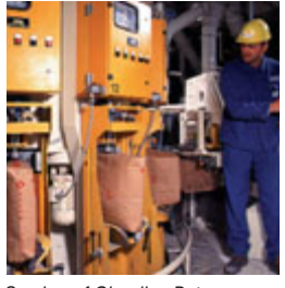
Service of Claudius Peters Packing Plant