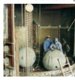
Service of Claudius Peters Grindina Plant