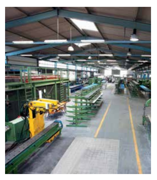
The 7000m<sup>2</sup> stringer production bay.