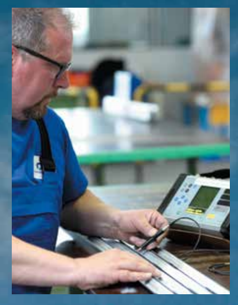
HFEC Surface Crack Testing.