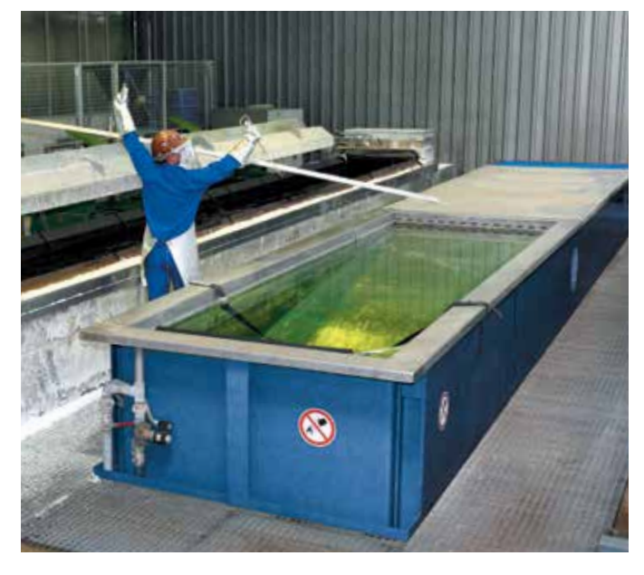
Lifting from the salt bath and quenching in the tempering bath.