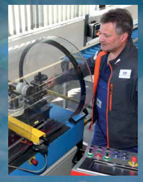
NC Roll Forming.