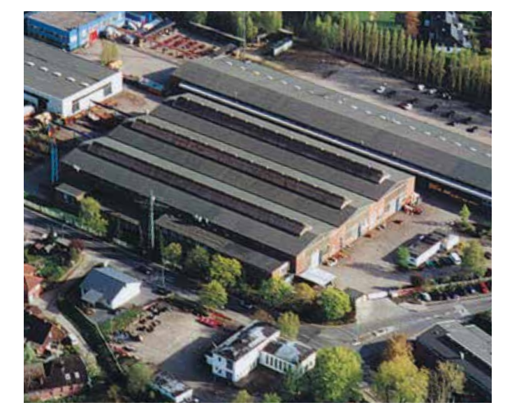
Claudius Peters' 45,000m<sup>2</sup> site, Buxtehude, Hamburg, Germany.

Over 5 million stringers, of over 200 different sizes supplied since 1980