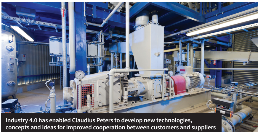
Industry 4.0 has enabled Claudius Peters to develop new technologies, concepts and ideas for improved cooperation between customers and suppliers

Through the cross-linking of data and machines, cross-platform collaboration and taking a holistic outlook, Claudius Peters is able to continuously understand and provide solutions to the challenges facing its customers. ■