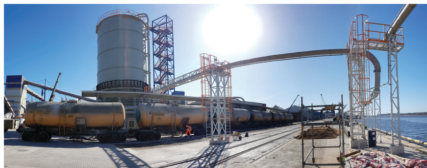
To prepare them for the challenges ahead, cement producers must become experts in networked thinking, open communication and across-the-board communication

The user receives important and comprehensive information during all project phases, with all QR codes and orders since 1994 made available upon request. Further services are currently under development and will be able to be retrieved via the CP Portal. The CP Portal module can also be scaled for extended requirements, allowing the customer to determine step-by-step which plants and machines to integrate into their portal. CP Smart Engineering enables this to be carried out quickly and efficiently.